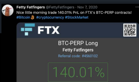
Sample tweet collected by Inca's geo-tagging tool